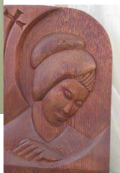
A wood carving of Nano Nagle as a young novice