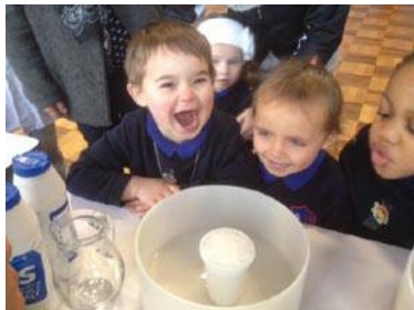
Little Einsteins from Our Lady of Lourdes Primary School.

Parents of local students were invited into the vibrant Science Department in Colaiste Nano Nagle to participate in a series of training sessions to facilitate them to learn new skills in experimental science.