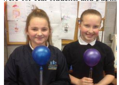
6th Class pupils from St Johns National School.

Comments from delighted parents included: "I never thought that Science and School could be so much fun"