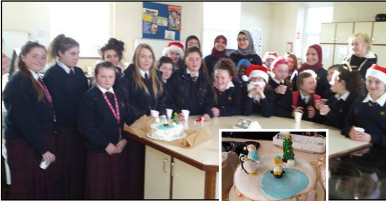
1st years helped to decorate a Christmas cake that will be raffled to raise money for the Neo Natal Unit in Limerick