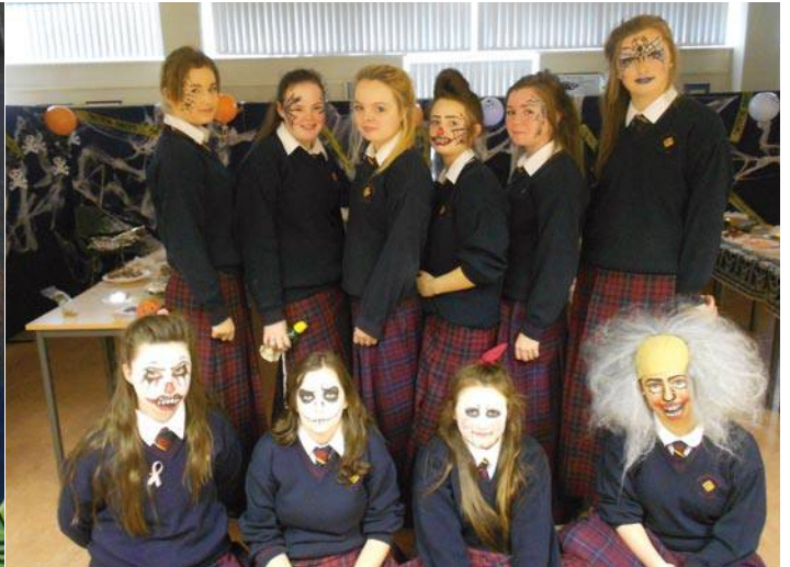
TY students during their Halloween bake sale which raised over €120 for the neo-natal unit in the Limerick Maternity hospital - Thanks to everyone who supported