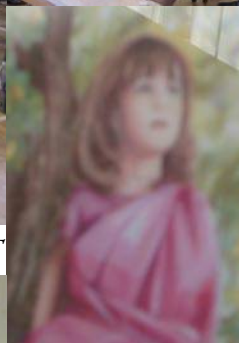
Nano Nagle as a young girl