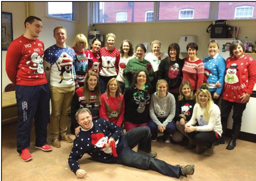
A joyful Staff - Christmas Jumper Day Coláiste Nano Nagle 15th December 2014 - All funds go to SVP